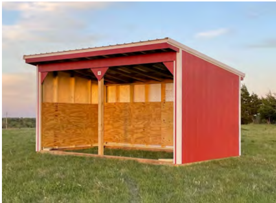
8x16 open paddock