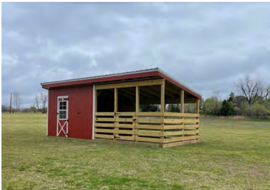
10x24 closed paddock (floor plan A)

ADDITIONAL OPTIONS: -Window in walk door $70 -Extra gate in paddock area $125 -Earth anchors $35 each (Recommended) -CrossBreeze slider vents $100 ea