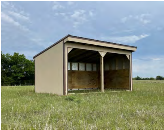
10x16 open paddock