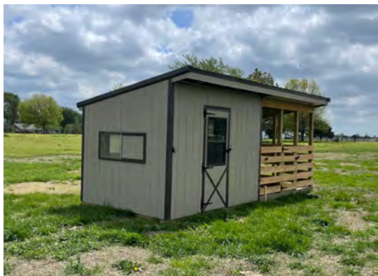
8x20 closed paddock (floor plan B)