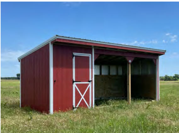
8x20 open paddock W/feed room