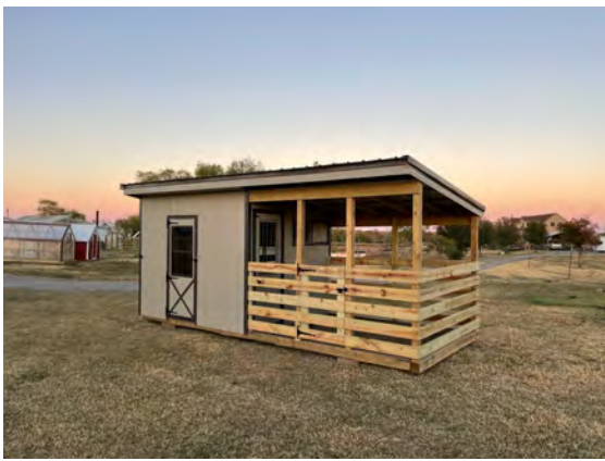
8x20 closed paddock (floor plan B)