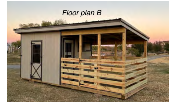
Floor plan B Closed Paddock Shelter Features: